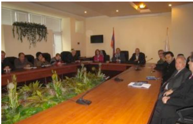
Meeting With SEUA Deans on Distance Learning