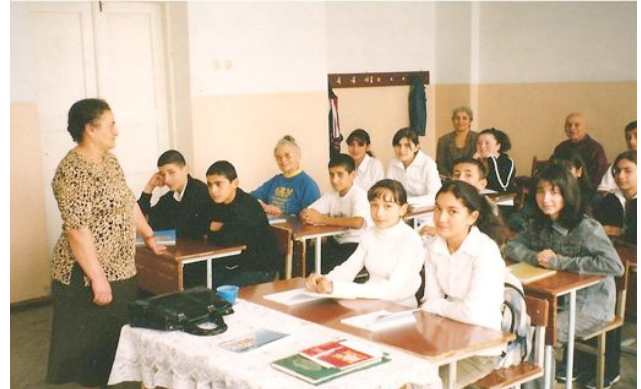
Անիւեանները Արցախի 8-րդ մէկ դասարանի մէջ

բոլոր դպրոցներու 5-6-7-8 կարգերուն: Ուստի, տարին աւելի քան 30,000 աշակերտներ պիտի օգտուին այս ծրագրի բարիքներէն: Փոխ Նախարարին ըսի որ եթէ կարնոր նոր ծրագիրներու կարիքը կայ և կառավարութիւնը գործադրելու դժուարութիւն ունի, և կամ միջոցները կը պակսին, թող չվարանին դիմելու ԱՐՓԱ-ի վարչութեան և կամ մեզի: