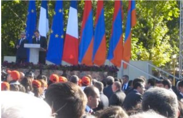
President Sarkozy's Visit to Yerevan

October 7: President Sarkozy was on an official visit to Yerevan and hundreds of thousands of people were in the French square in Yerevan. He donated a statue by a famous sculpture from France and stated clearly that France will fight for the recognition of the Armenian Genocide by Ottoman Empire in 1915.