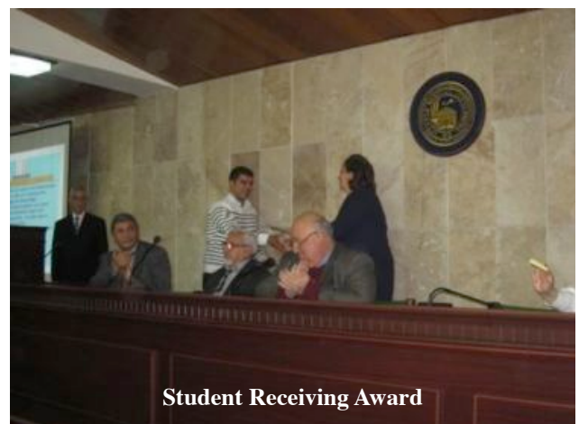
Student Receiving Award